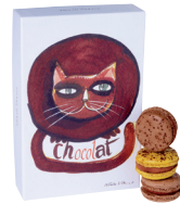
CHAT CHOCOLAT BRUN 16 pieces : £ 33