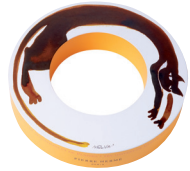
INITIATION CHAT CHOCOLAT 20 pieces : £ 52