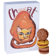
CHAT CHOCOLAT ROUX 16 pieces : £ 33