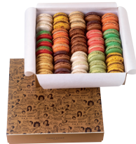
TOUT LE MONDE EN PARLE 40 pieces : £ 71 SIGNATURE 40 pieces : £ 71