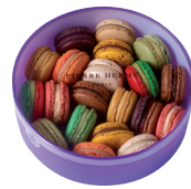
ROUND BOX 12 pieces : £ 23 20 pieces : £ 35