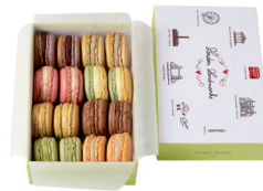
LONDON LANDMARKS 16 pieces : £ 33