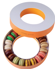
INITIATION 20 pieces : £ 52