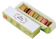
LONDON LANDMARKS 7 pieces : £ 15